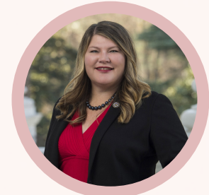
TASHA BOERNER HORVATH CALIFORNIA STATE ASSEMBLYMEMBER 76TH DISTRICT